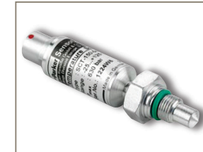
SCT temperature sensor - Precise measurement of oil temperatures up to 125°C - Screw-in or manual probe