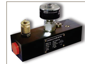
SCFT flow measurement turbine - Measuring ranges up to 750 l/min - Built-in pressure and temperature connections