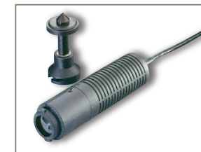
SCRPM rpm sensor - Simple and rapid rpm measurement - Up to 10,000 rpm