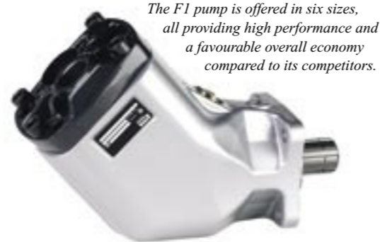
The F1 pump is offered in six sizes, all providing high performance and a favourable overall economy compared to its competitors.

right pump for every type of application. With its many unrivalled features, the F1 offers the truck owner a superior overall economy in combination with equally superior performance and reliability. Together with Parker's worldwide support, this adds up to the F1 being the perfect choice whatever the job is.