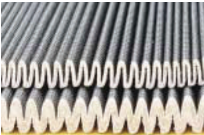
Photo above shows 'dry' Par-Gel filter media and the same media swollen with absorbed water.

The Par-Gel filter media is a highly absorbent copolymer laminate with an affinity for water. However, hydraulic or lubrication fluid passes freely through it and the water is bonded to the filter media.